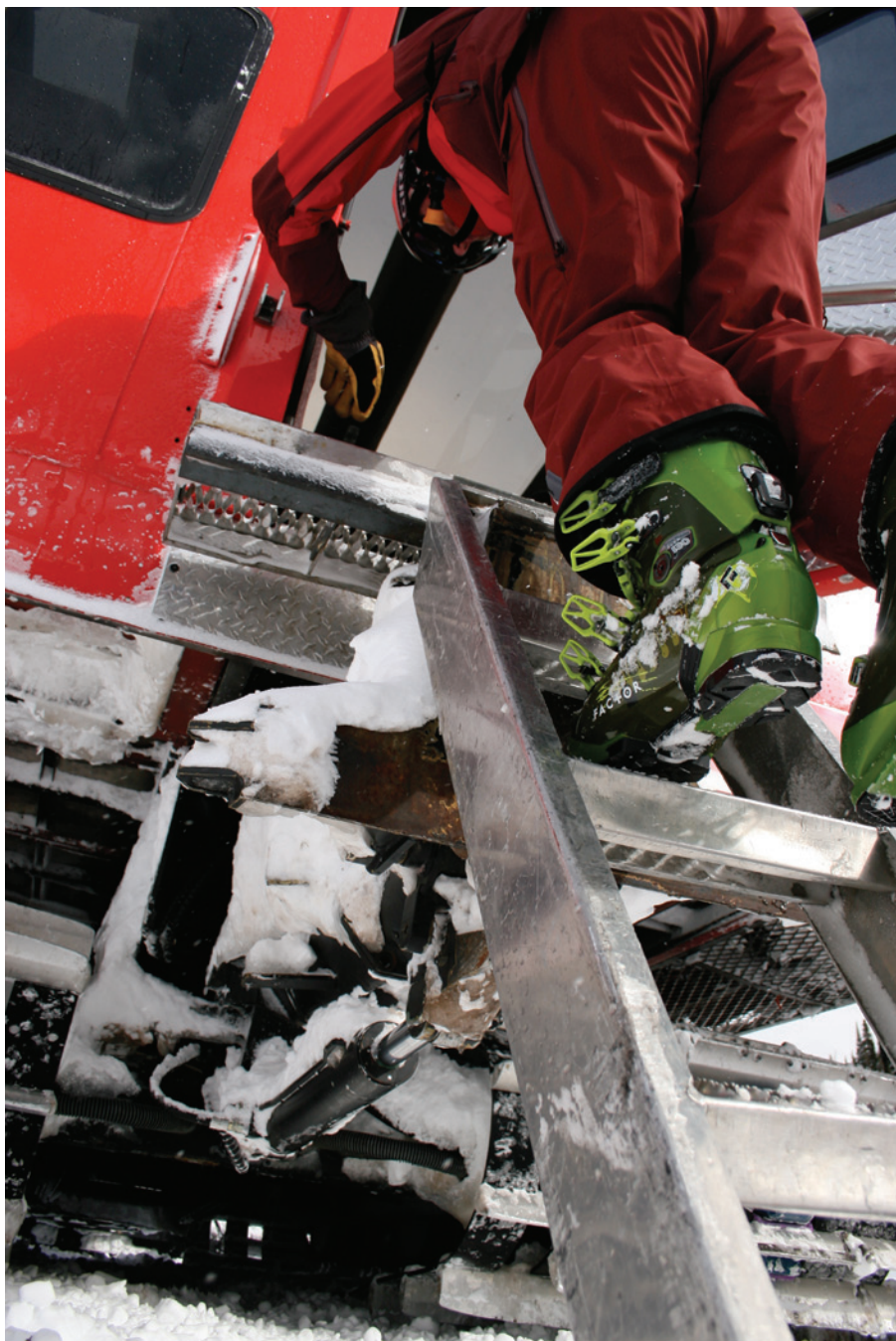
Black Diamond's culture calls for engineers to partake in the sports they design for as a way to stay in sync with customer needs.

these activities, but it's not easy to watch someone climbing and get a true understanding of what they're doing or how they're using the equipment. You have to be in their shoes to truly understand what they want."